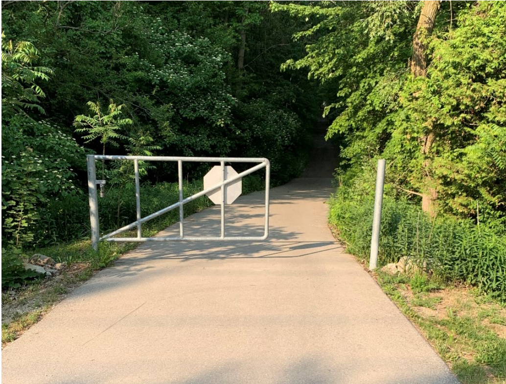
Figure 1: Existing Township Gate on Trestle Bridge Trail at Gilkinson Street (Elora)

$15,000 ($5,000) for each gate. Staff can incorporate these costs in the regular maintenance budget for the trails in future years.