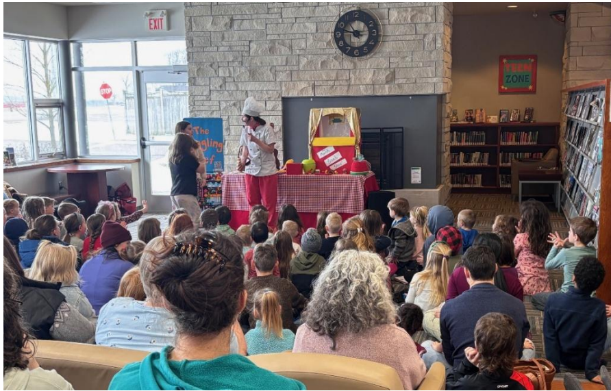
Fergus staff created an elaborate escape room that proved to be a very popular challenge