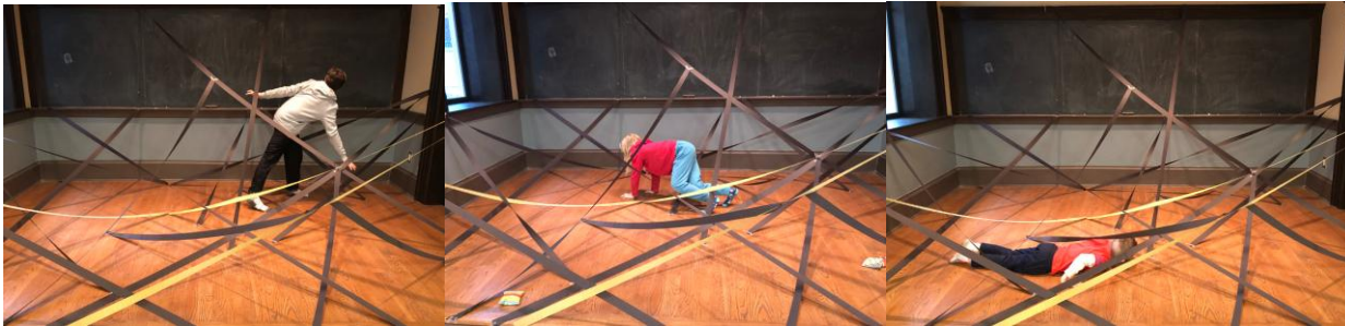
Participants finding their way through (below)