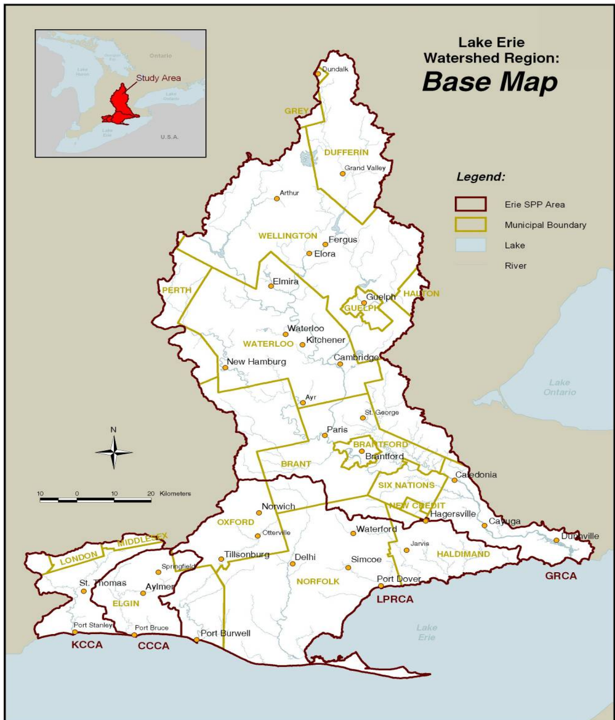
Map 1: Lake Erie Source Protection Region